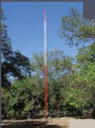
My Internet tower.