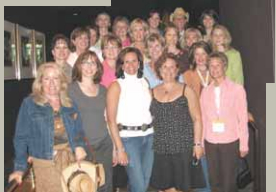
ABOVE: The team at NTC 2006 St. Louis.

Most of all, I want to thank God for making everything possible.