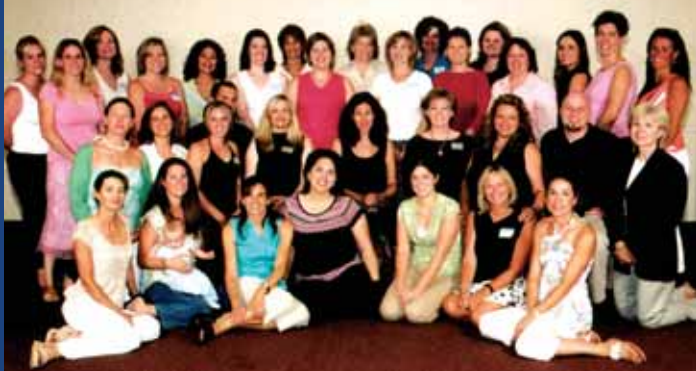
Members of the Nation.