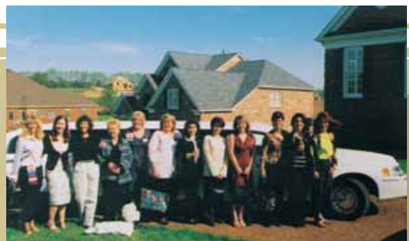
Challenge winners at NTC 2003 Nashville.

“ There is no secret. Commit to your business, take responsibility for your success and most of all believe in yourself. ”