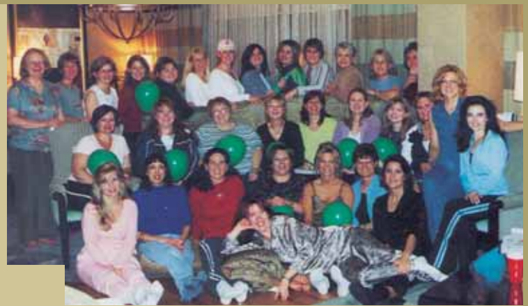
Manager retreat in January 2004.

anything really worth having worth working for? Cancelled classes will happen and people will quit but you have to keep your eye on your long-term goal.