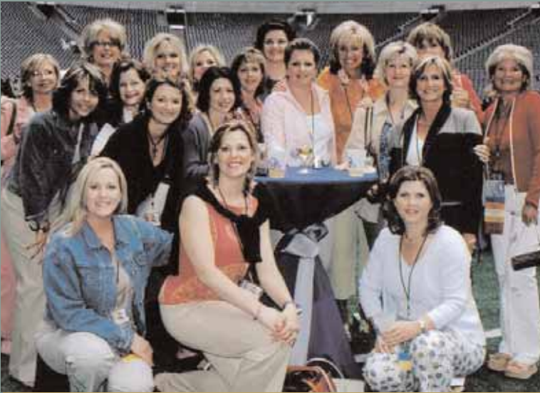
All of the new Managers at the New Manager celebration at NTC 2004 Texas.