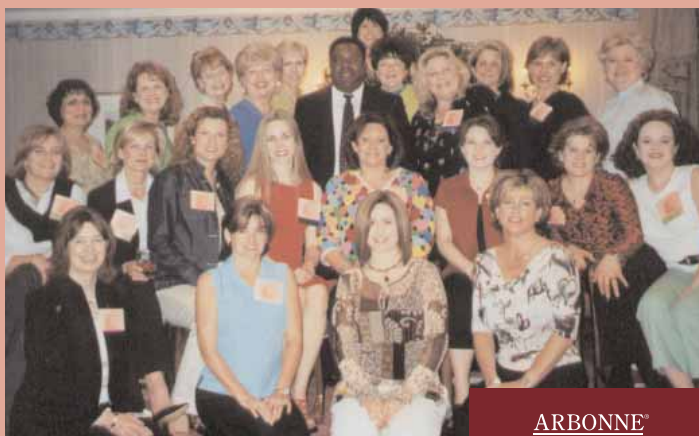
NTC 2003 Nashville: Some of Oklahoma, Missouri, Florida, Georgia, Kansas and Texas team.