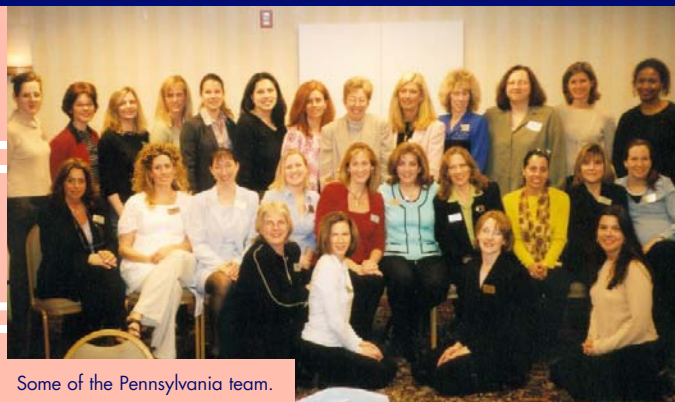
Some of the Pennsylvania team.