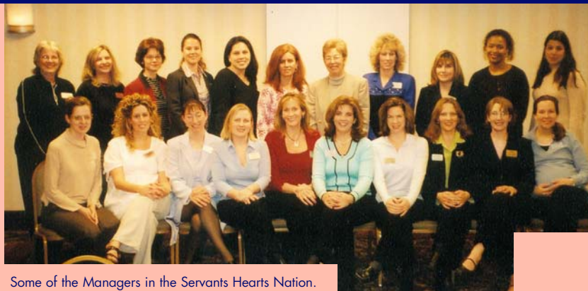
Some of the Managers in the Servants Hearts Nation.