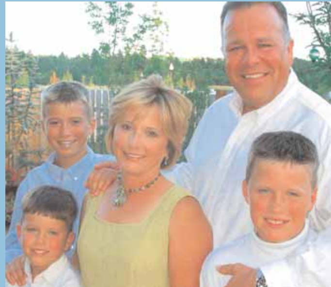
The Partee family.