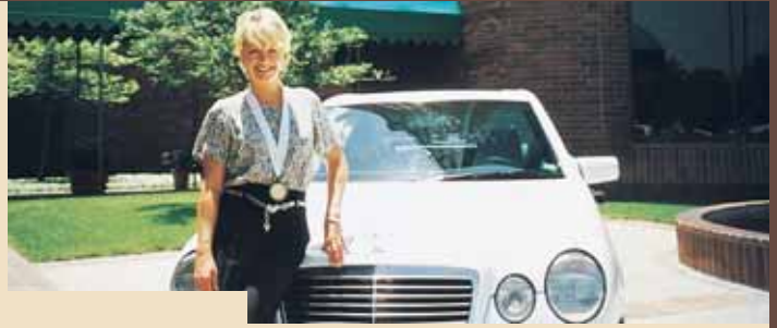
MIS (now NTC) after earning Parade of Champions, Dallas, Texas 1997.