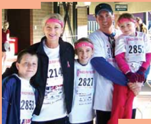
The Sigler Family at the Race for the Cure.