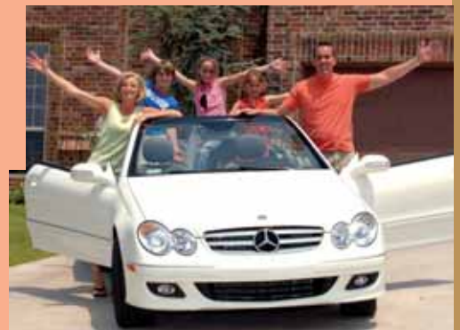
The Sigler family with their new Mercedes-Benz.