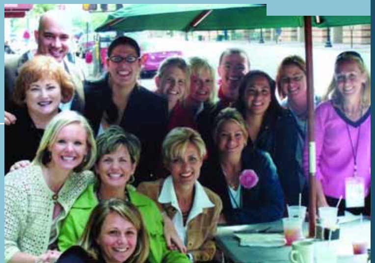
Having fun at ACTnow Louisville.

“ Once you decide to get committed, the doors of opportunity open. ”