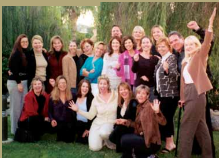
Members of the team at a training.

The testimonials in this story reflect the actual experience of an individual, are anecdotal only, and may be atypical.