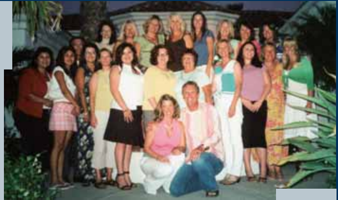
The beginning of the Inspiration Region.

me my entire life throughout all of my accomplishments. I would not be a loving and positive woman if it were not for all of your wisdom, guidance and love! I love you all. Thank you!