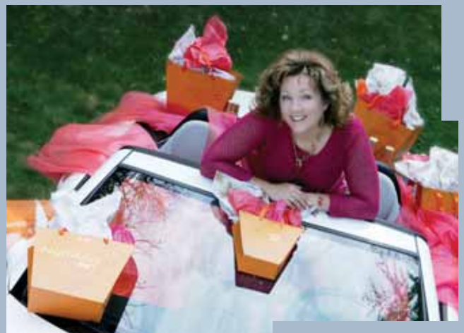
Enjoy the journey.