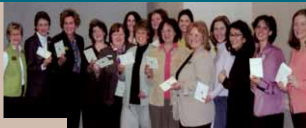
"Cash to Convention" winners.

2002, Arbonne has experienced 100 percent yearly growth. Now is the right time with the right company. Are you the right you?