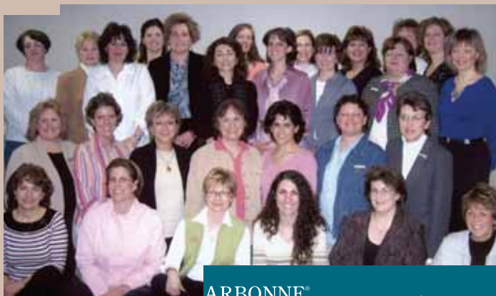
Some members of Cheryl's Nation.

Arbonne is indeed a wonderful gift, we just have to be willing to unwrap it! Are you willing?